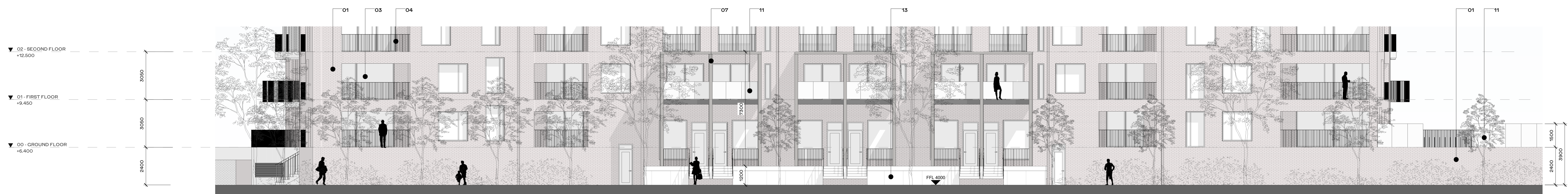
1 BLOCK B GROUND FLOOR - SOUTH ELEVATION 1:100