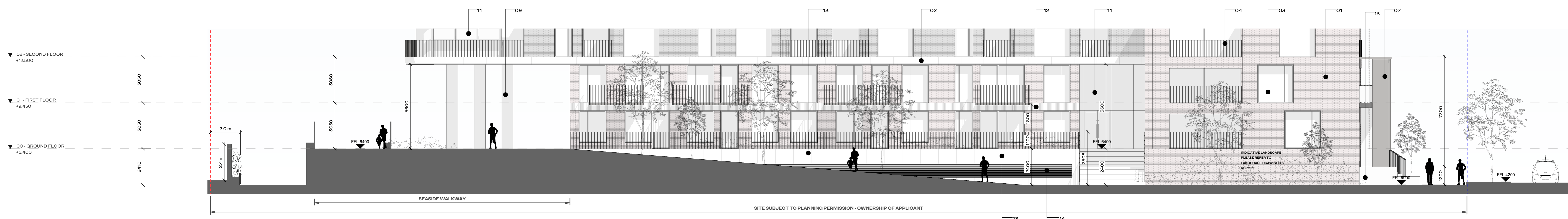
2 BLOCK B GROUND FLOOR - WEST ELEVATION 1:100